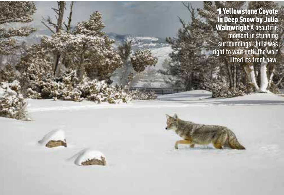
1 Yellowstone Coyote in Deep Snow by Julia Wainwright A beautiful moment in stunning surroundings. Julia was right to wait until the wolf lifted its front paw.