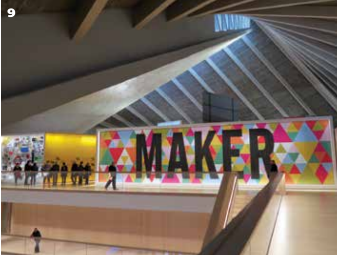
9 Design Museum by Trevor Alexander Great composition, with plenty of lead-in lines, and the figure bottom left providing an excellent 'punctuation' point.