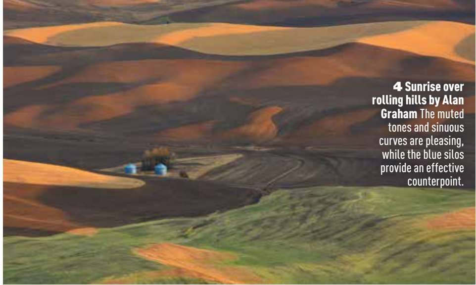
4 Sunrise over rolling hills by Alan Graham The muted tones and sinuous curves are pleasing, while the blue silos provide an effective counterpoint.

Want to see your club featured on these pages? Drop us a line for more information at apl@ti-media.com